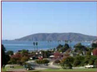
Shell Beach & Port San Luis

My broad experience and knowledge includes marketing, financing, and buyer and seller representation. I pay attention to details, providing you with the assurance of a complete, professional approach necessary in today's market, keeping your individual needs in mind.