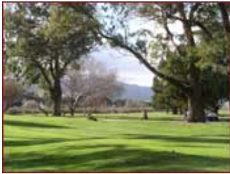
Rancho Maria Golf Course

I am a licensed REALTOR® and a full-time professional specializing in selling real estate on the Central Coast for over a decade. You will find me to be enthusiastic and concerned with a genuine commitment to providing you with unsurpassed real estate service. I ensure your needs are met in a professional and honest manner.