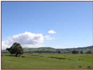
Santa Maria Valley

Call Me Now for a FREE Consultation - 805.878.1187